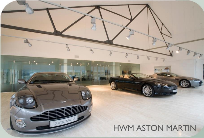
HWM ASTON MARTIN