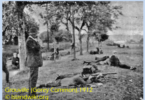
Grouville (Gorey Common), 1912

Marksmanship continued and grew across both islands and, with the mainstream development of gunpowder, not to mention firearms capable of accurately and safely employing it, the bow gave way to the rifle. In the 19th century the comparison between island and mainland continued and following