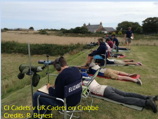
CI Cadets v UK Cadets on Crabbé

The future also bodes well, with both Guernsey's Elizabeth College and their Jersey counterparts at Victoria College actively promoting the sport amongst their students. This includes, since 2010, having hosted visiting teams from the UK Cadet Forces in the same spirit as the national bodies do with this very tour. A strong fight can be expected from each island on their home soil, with team match victories by visitors being hard to achieve and