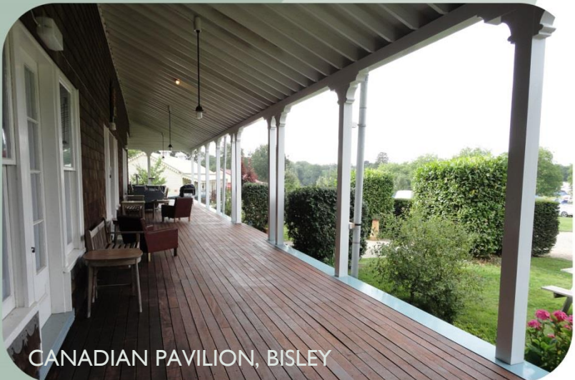
CANADIAN PAVILION, BISLEY