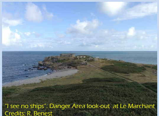
“I see no ships”. Danger Area look-out at Le Marchant

Modern shooting has brought many changes to the sport and any individual, or team, looking to succeed has no time for resting on their laurels. Once again, the islands have not