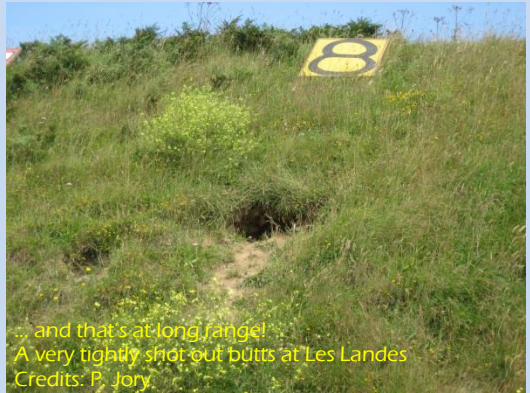
and that's at long range! A very tightly shot out butts at Les Landes

disappointed, remaining very much on top of their (and for that matter, everyone else's) game. Jersey have followed Guernsey's Kolopore history with wins in 1984 & 1995. Further, competitors from both islands (naming no names, so as to avoid offending those that we omit!) make regular appearances on the much-coveted Grand Aggregate leader-board, not to mention on several trophies. The 2014 Commonwealth Games saw both islands make the top 10 in the results tables for full bore rifle, continuing a 32 year run of doing so since 1982. No mean feat for a combined population of less than your mid-sized town.