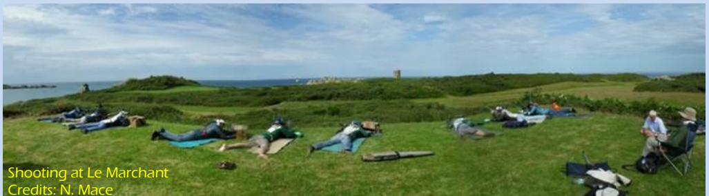
Shooting at Le Marchant