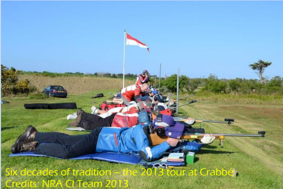
Six decades of tradition – the 2013 tour at Crabbe

Target shooting in the islands was, like much of the world, curtailed during both world wars. The islands’ sport suffered particularly heavily between 1940-45 with the loss of rifles, being as they were, the